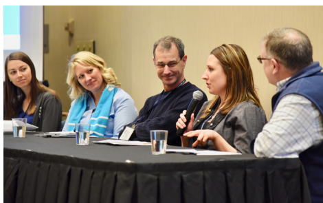
Habitat MN staff and three affiliate Executive Directors at the 2020 OLE Conference

February 2020: Habitat Minnesota hosted the 2020 OLE (Outstanding Leadership & Excellence) Conference in Alexandria, MN. More than 90 Habitat leaders attended. Competent Person Training was also held, with 27 attendees.