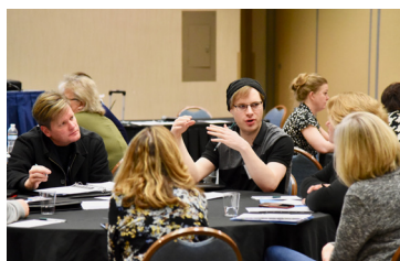
Attendees at the 2020 OLE Conference