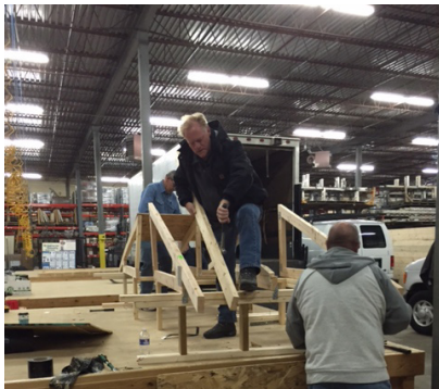
Participants build a sample roof section at the FORTIFIED Home Training, sponsored by Western National Insurance and Simpson Strong-Tie.

Habitat Minnesota has a few different ways for affiliates to earn and save money just by building healthy, durable, and efficient homes: