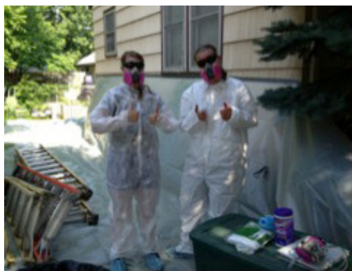
The crew suits up for lead-based paint safety at a Winona-Fillmore Habitat repair project.

As you likely know, Habitat International recently added Competent Person Safety Standards to the list of requirements for participation in national programs. A Competent Person is someone designated by your Habitat affiliate to ensure compliance with safety regulations. Habitat International has published standards for who can be a Competent Person; these can be found along with a list of upcoming trainings on My.Habitat. Habitat Minnesota hosts a Competent Person training every other year; our next training will be in 2018 .