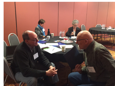
2018 OLE Conference attendees