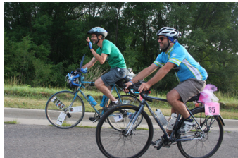
2017 Habitat 500 riders

Habitat Minnesota staff made more than 70 visits to 22 Minnesota affiliates in FY18.