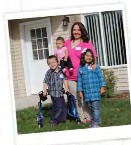
"I can breathe better."