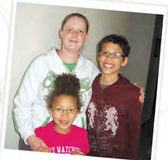
"My kids study more and get better grades."